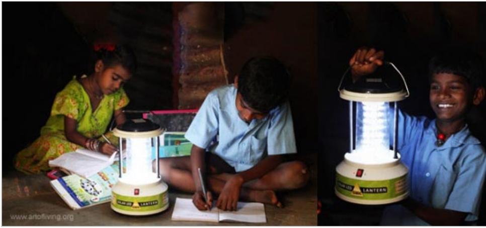
Solar LED Systems

New Delhi: In addition to environmental benefits, shifting away from inefficient and polluting fuel-based lighting such as candles, firewood, and kerosene lanterns to solar LED systems can spur economic development as well to the tune of two million potential new jobs, a study says. The researchers analysed how the transition from polluting fuel-based lighting to solar-LED lighting would impact employment and job creation.