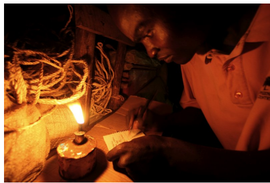
Fuel-based lighting provides lighting at many light markets, such as this one in Kenya.

While there is some overlap in terms of skillsets required for the new jobs, retraining and education would be necessary. The new jobs span the gamut, from designing and manufacturing products to marketing and distributing them. "The challenge of re-employing