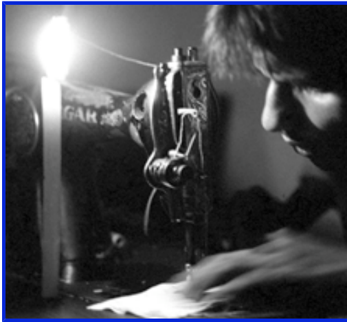
Tailor working by candlelight in an "electrified" village in India.

Although sometimes driven by good intentions such as reducing demand for fuel wood, fuel subsidies divert public sector funds from other uses. In India, where nearly 600 million people are without electricity, kerosene and liquid propane gas subsidies are of the same magnitude as those for education (16). Subsidies also create price distortions that discourage conservation and encourage dangerous and polluting fuel adulteration in the domestic and transport sectors (17, 18).