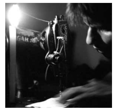
Tailor working by candlelight in an "electrified" village in India.

Fuel-based lighting embodies enormous economic and human inequities. The cost per useful lighting energy services ($/luxhour of light, including capital and operating costs) for fuel-based lighting is up to ~150 times that for premium-efficiency fluorescent lighting (see figure, next page). The total annual light output (about 12,000 lumen-hours) from a simple wick lamp is equivalent to that produced by a 100-watt incandescent bulb in a mere 10 hours.